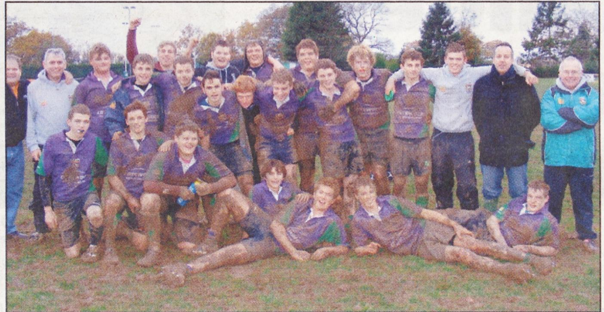
The victorious if mud-plastered Minety Academy U17s team

Minety continued to drive deep into the heart of the